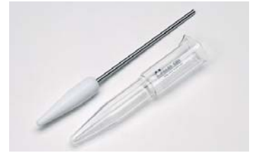
Homogeniser with overflow flare with lip and teflon pestle, tapered

Please moisten pestle and homogenising vessel before homogenising. Carefully insert the pestle into the homogenising vessel at a low rotational speed.