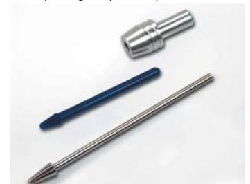
EPPI-pestle made of polypropylen and stainless steel with quick-grip clamp