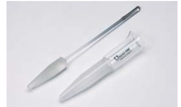
Homogeniser with overflow flare with lip and glass pestle, tapered