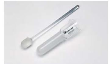
Homogeniser with overflow flare with lip and glass pestle, cylindrical