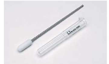
Homogeniser with overflow flare with lip and teflon pestle, cylindrical