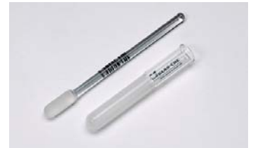
Homogeniser with overflow flare, without lip and glass pestle, cylindrical