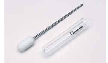
Homogeniser as centrifuge tube with teflon pestle, cylindrical